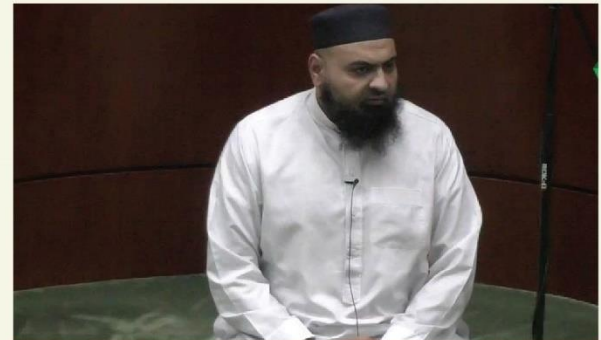
Hajj Briefing in Mina