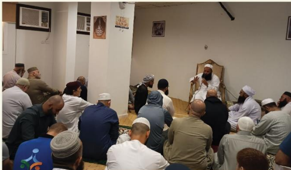
Hajj Briefing in Aziziya Building