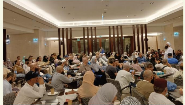
Hajj Briefing in Makkah Hotel