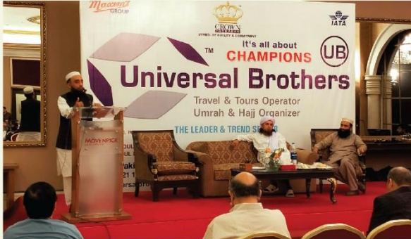
Hajj Briefing in Movenpick