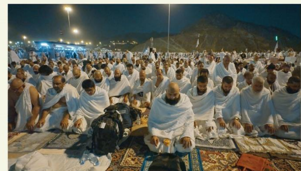
Waqoof in Muzdalfa