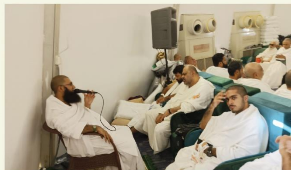
Hajj Briefing in Arafat